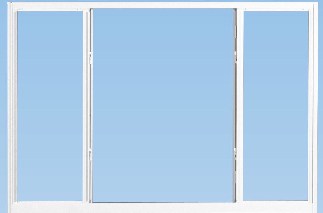
HORIZONTAL ROLLER FLANGE SERIES 201 SIDE VIEW DETAIL

Note: Masonry openings given assume a precast sill and a 1x buck. If using poured sill, add 3/4". Framing dimensions are calculated with drywall butted against window frame.